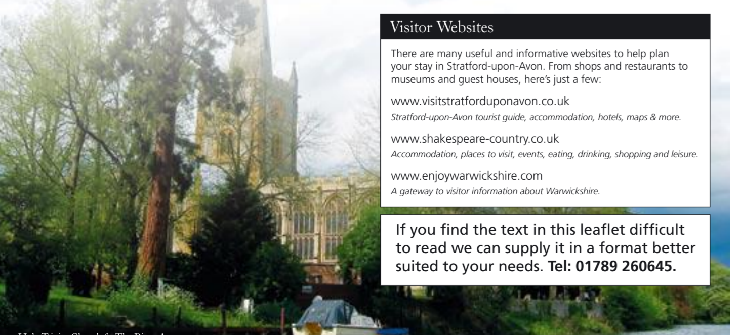
Holy Trinity Church & The River Avon